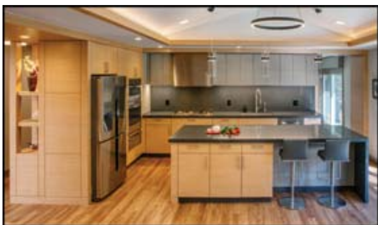
35 years of experience in architectural design